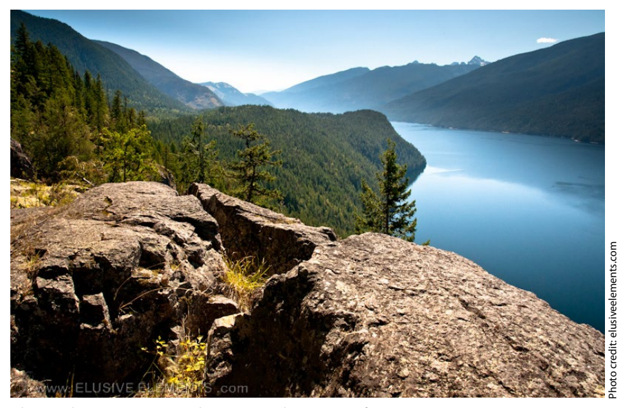
Slocan Lake: a Kootenay gem that CKISS works to protect from invasive species

British Columbia is the most ecologically diverse province in Canada making the Central Kootenays a beautiful place to work, live and play. The Central Kootenay Invasive Species Society (CKISS) strives to keep our lakes pristine, forests lush, mountains healthy and economies thriving through education and managing invasive species in an effective way.