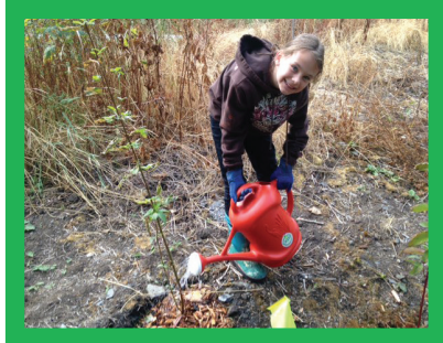
Kootenay Gallery restoration site