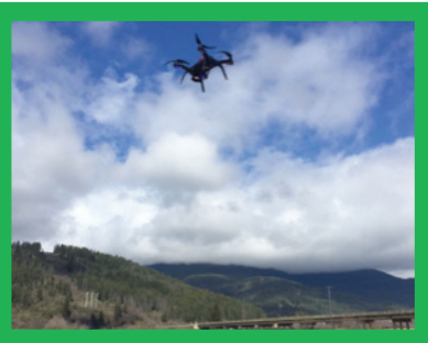
UAV flying, Selkirk College

In partnership with the Selkirk College Geospatial Research Centre and the Creston Valley Wildlife Management Area, CKISS helped determine yellow flag iris colour signature and coverage with use of an Unmanned Aerial Vehicle (UAV).