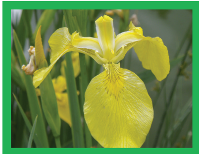
yellow flag iris