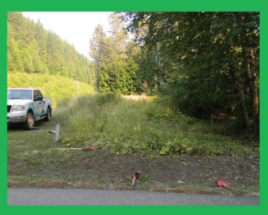
Pre-restoration, Summit lake

Thanks to funding from Environment Canada’s EcoAction Community Funding Program and Columbia Basin Trust, 443 native species were planted by volunteers and school groups to restore three sites; Summit Lake Provincial Park, Waneta and Kootenay Gallery.