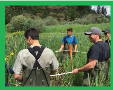
UAV hoop, Selkirk College