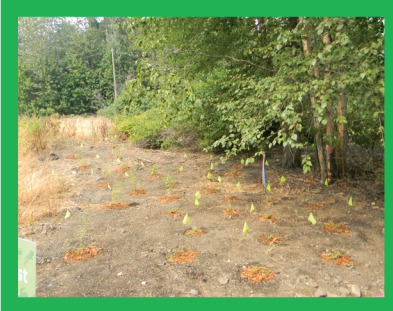
Post-restoration, Summit lake