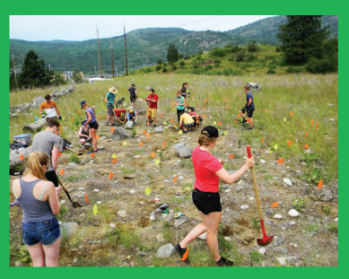
Waneta restoration site