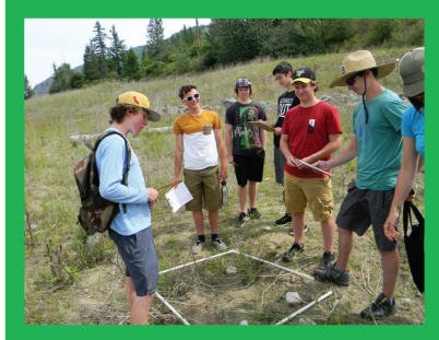
Waneta restoration site