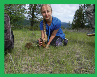
Kootenay Gallery restoration site